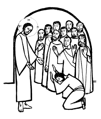
2nd Sunday of Easter (A) 16 April 2023

Serving St Benedict's, St Mary's & St Oswald's, Warrington