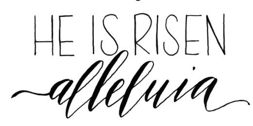
Easter Sunday Sunday 9 April 2023 at 10.30 am

Serving St Benedict's, St Mary's & St Oswald's, Warrington