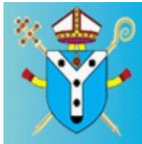
Archdiocese of Liverpool

Serving St Benedict's, St Mary's & St Oswald's, Warrington