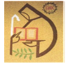
Our Benedictine Heritage

St Benedict's Church is open Monday to Friday 9.00 am – 4.30 pm for Private Prayer (Exc. Bank Holidays)