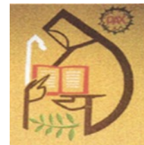
Our Benedictine Heritage