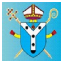
Archdiocese of Liverpool

Serving St Benedict's, St Mary's & St Oswald's, Warrington